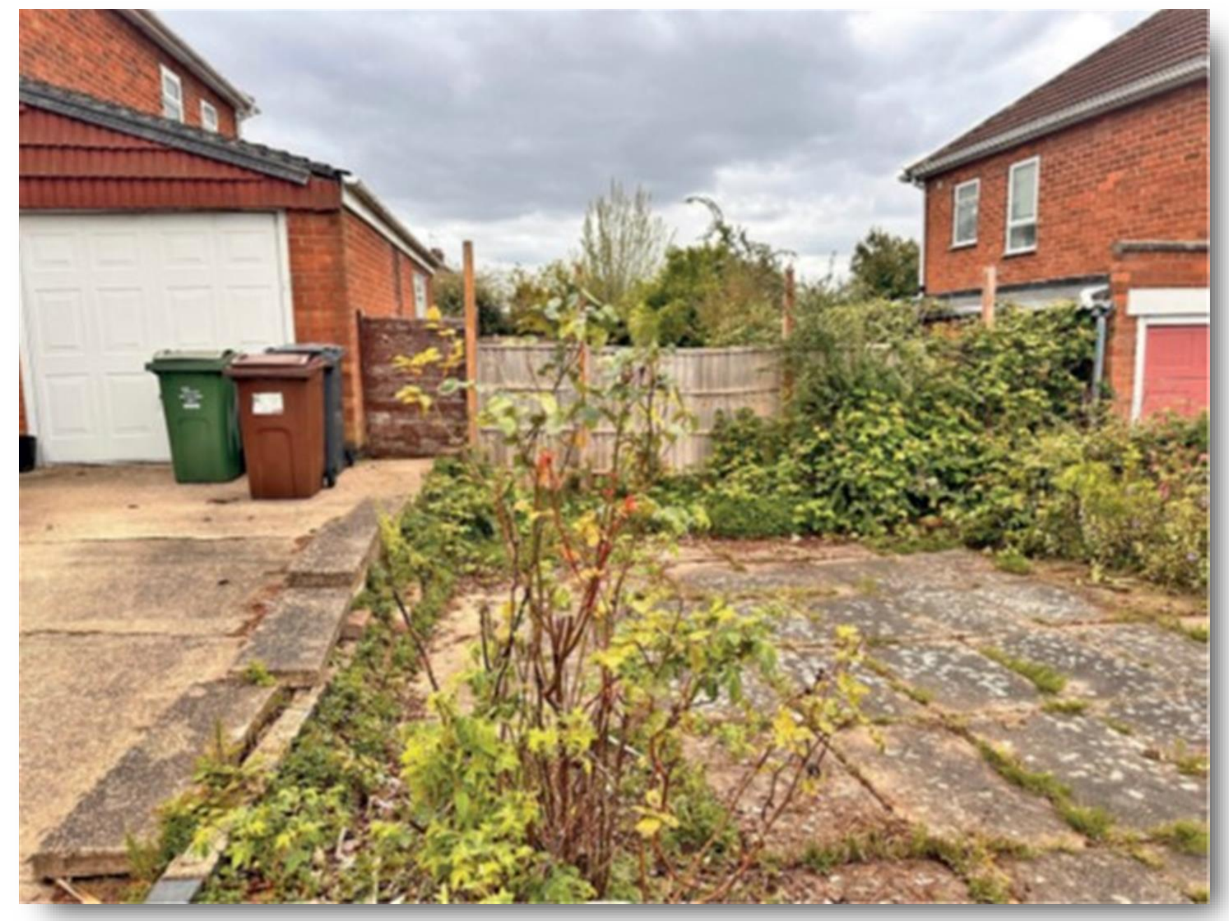
Land To The Side Of Parkdale Road, Thurmaston Leicester LE4 8JP