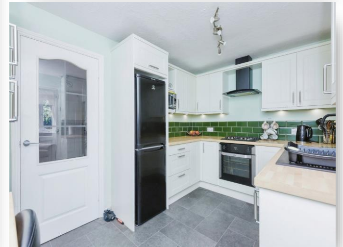
Glebelands Road, Leicester LE4 2WB