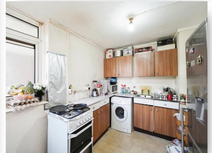
Christow Street, Leicester LE1 2GJ