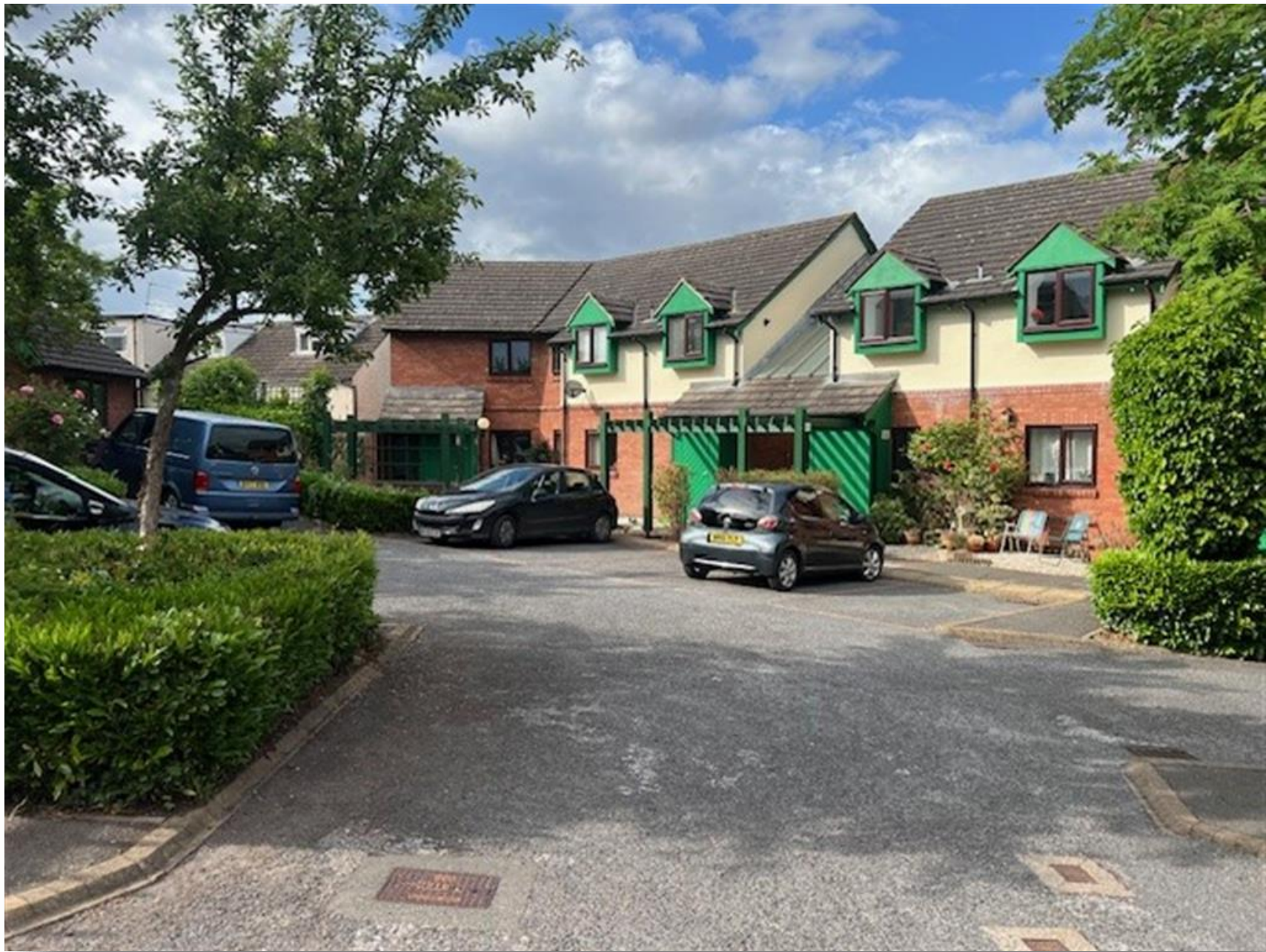
St. James Court Front Street, Birstall Leicester LE4 4DY