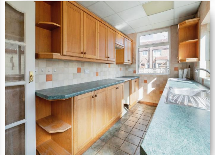
Hobson Road, Leicester LE4 2AR