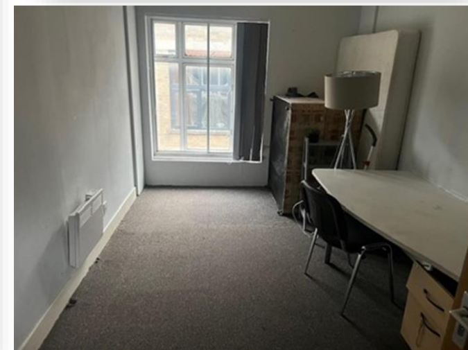
Granby Buildings Granby Street, Leicester LE1 6EH