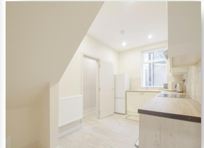
Bede Street, Leicester LE3 5LD