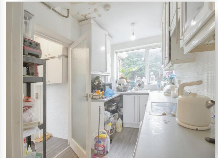
Beeby Road, Scraptoft Leicester LE7 9SH