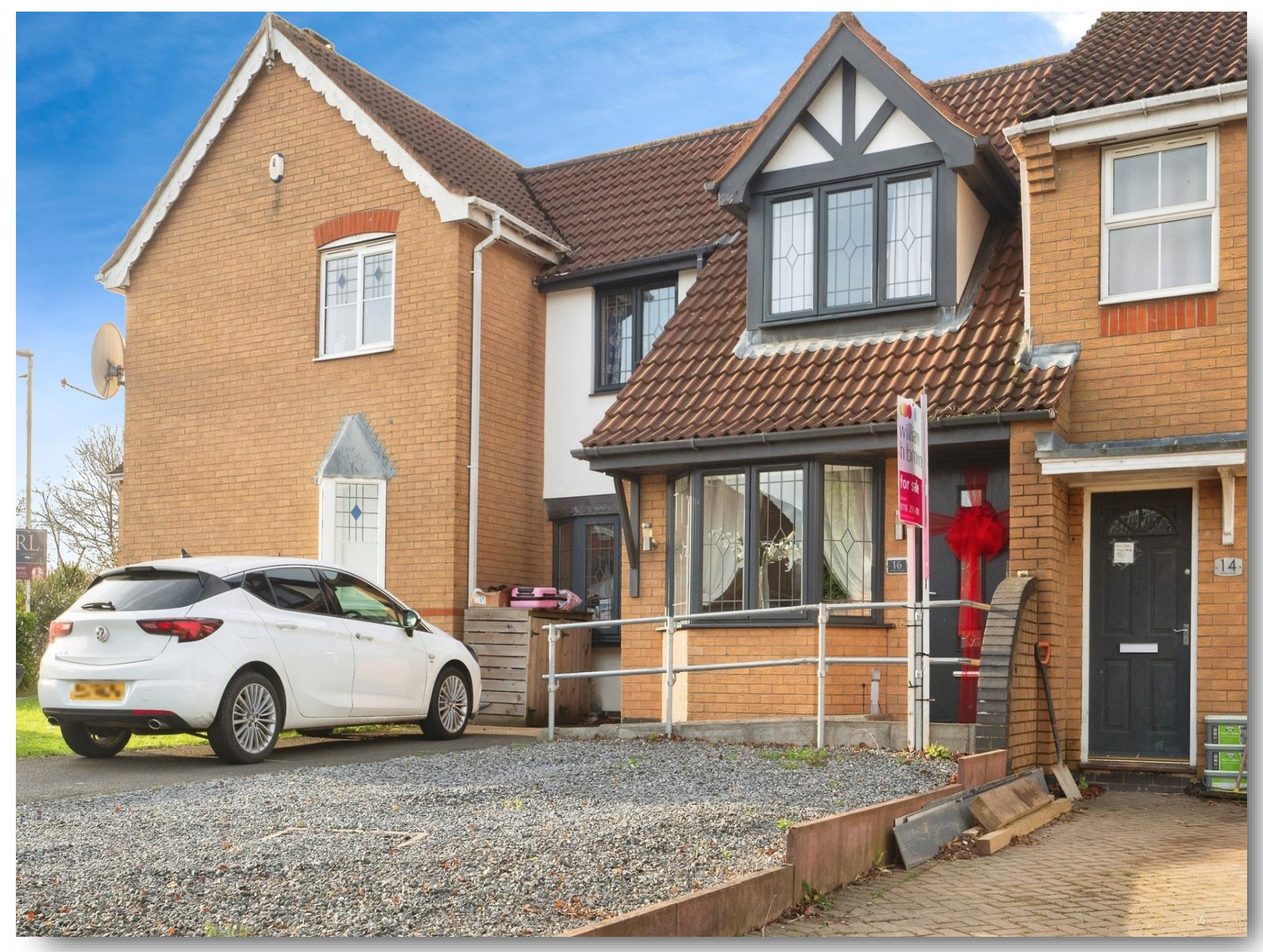
Owen Close, Braunstone Leicester LE3 3TZ