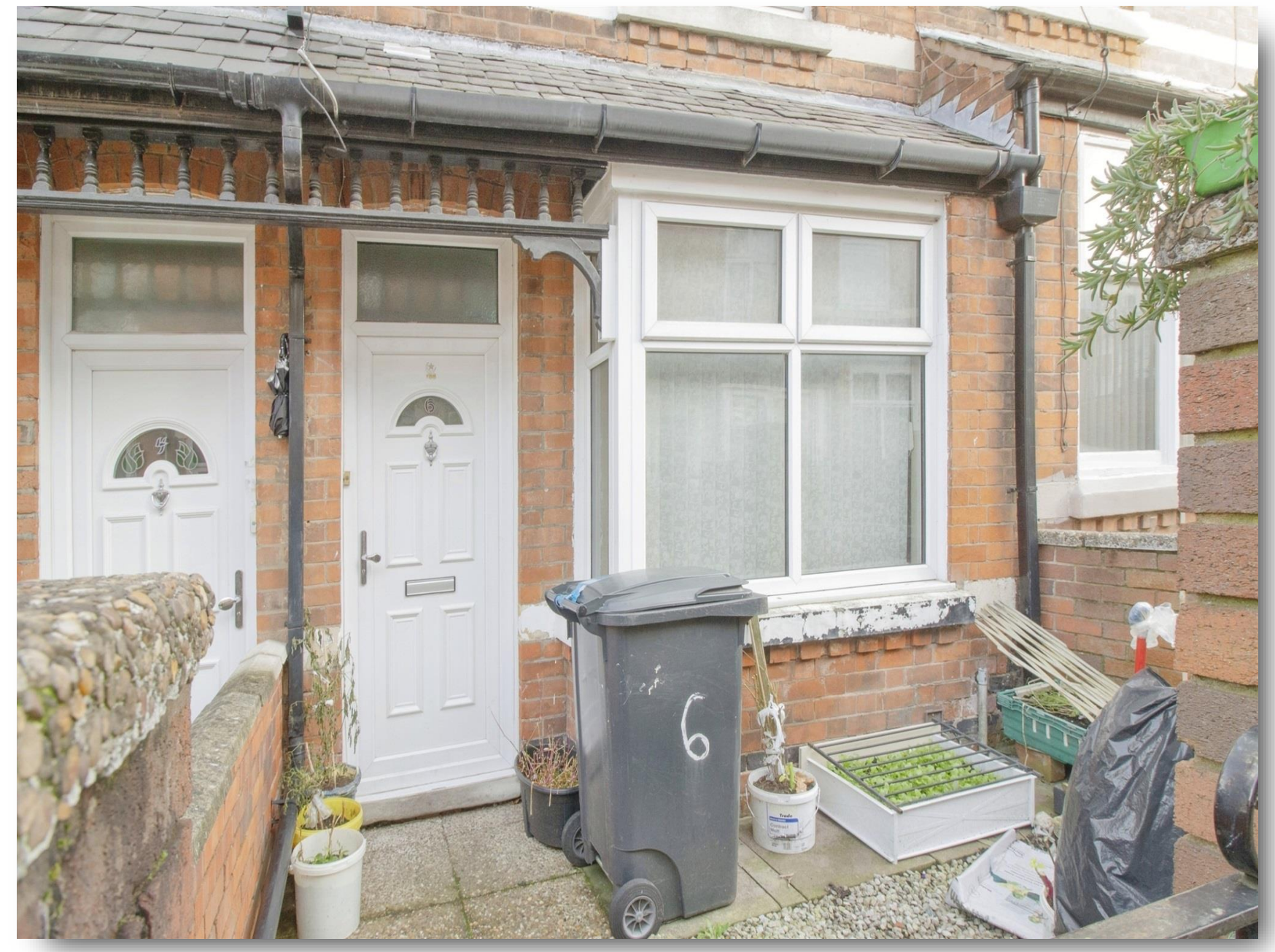
Guthlaxton Avenue, LEICESTER LE2 0SD