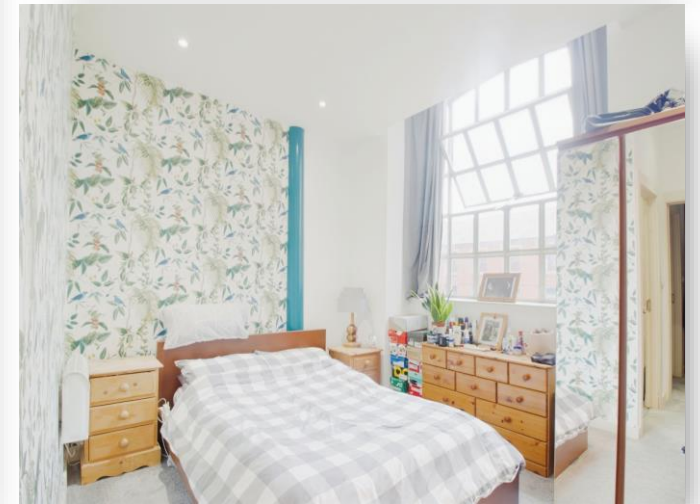
St Georges Mill Wimbledon Street,Leicester LE1 1SY