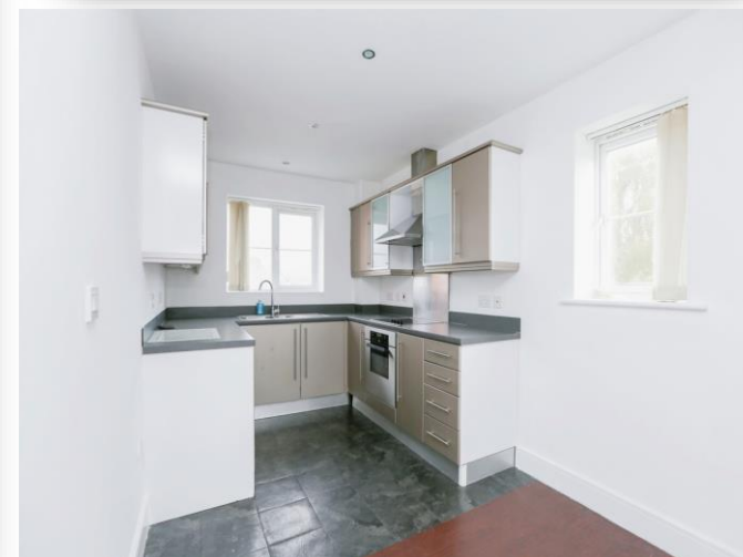
Granby Place Carty Road, Hamilton Leicester LE5 1QG