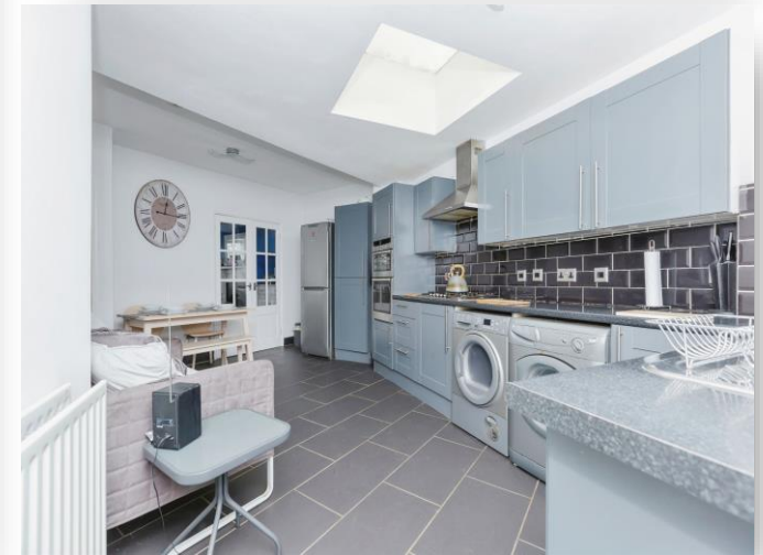
Astill Drive, Leicester LE4 2PB