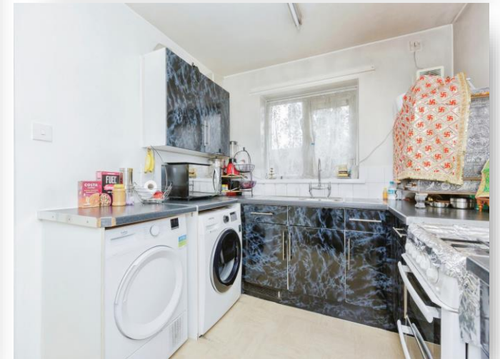
Martin Street, Leicester LE4 6EU