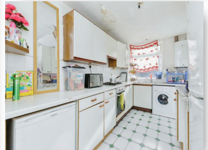
Mereworth Close, Leicester LE5 0NS