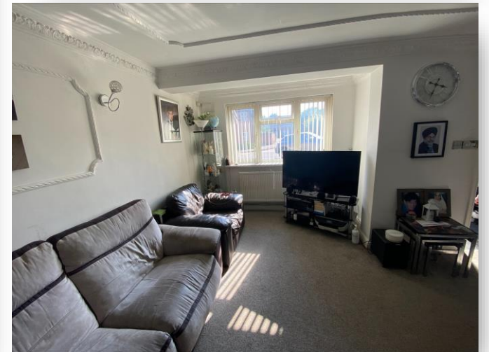
Sandhurst Close, Leicester LE3 6RD