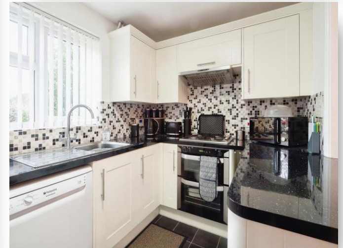
Marshall Close, Braunstone Leicester LE3 3RQ