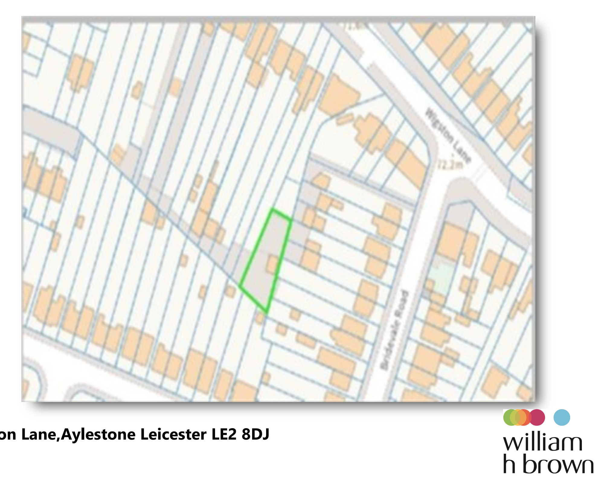
Wigston Lane, Aylestone Leicester LE2 8DJ