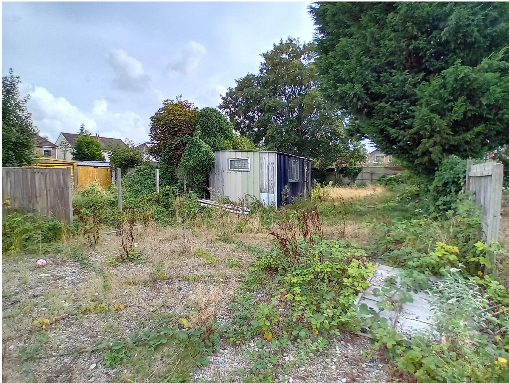
Wigston Lane, Aylestone Leicester LE2 8DJ