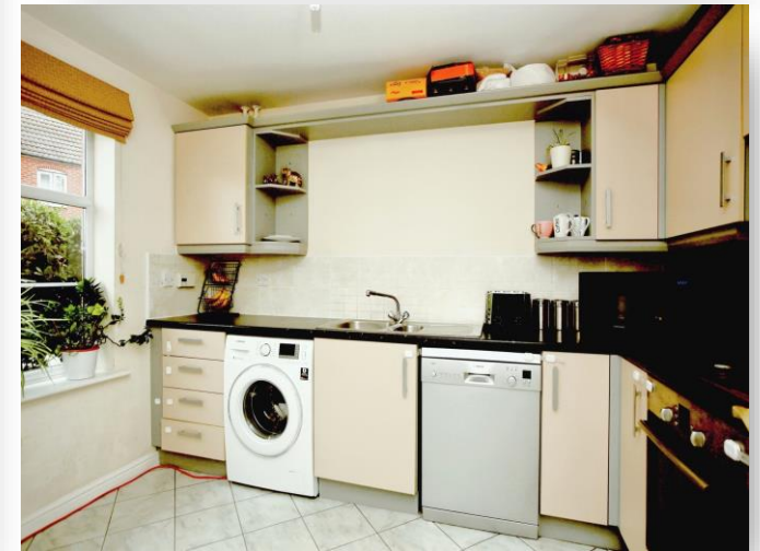
Heybridge Road, Leicester LE5 0AP