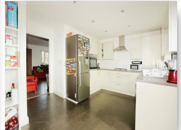
Wolsey Island Way, Leicester LE4 5FA