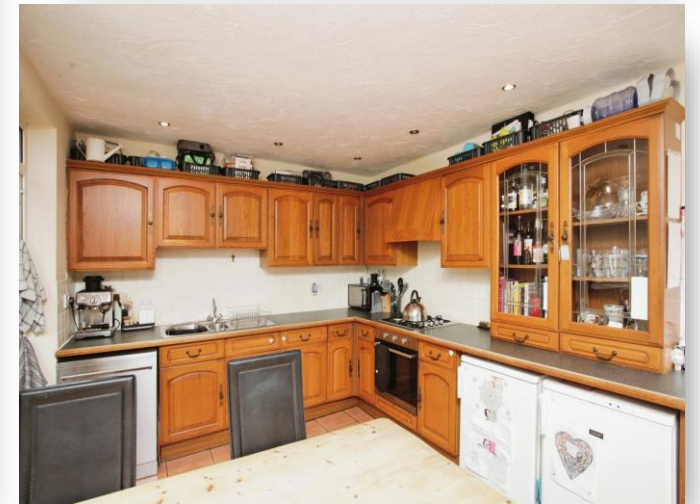
Pool Road, Leicester LE3 9GL