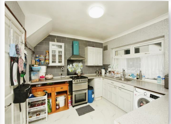
Selby Avenue, Leicester LE5 1ST