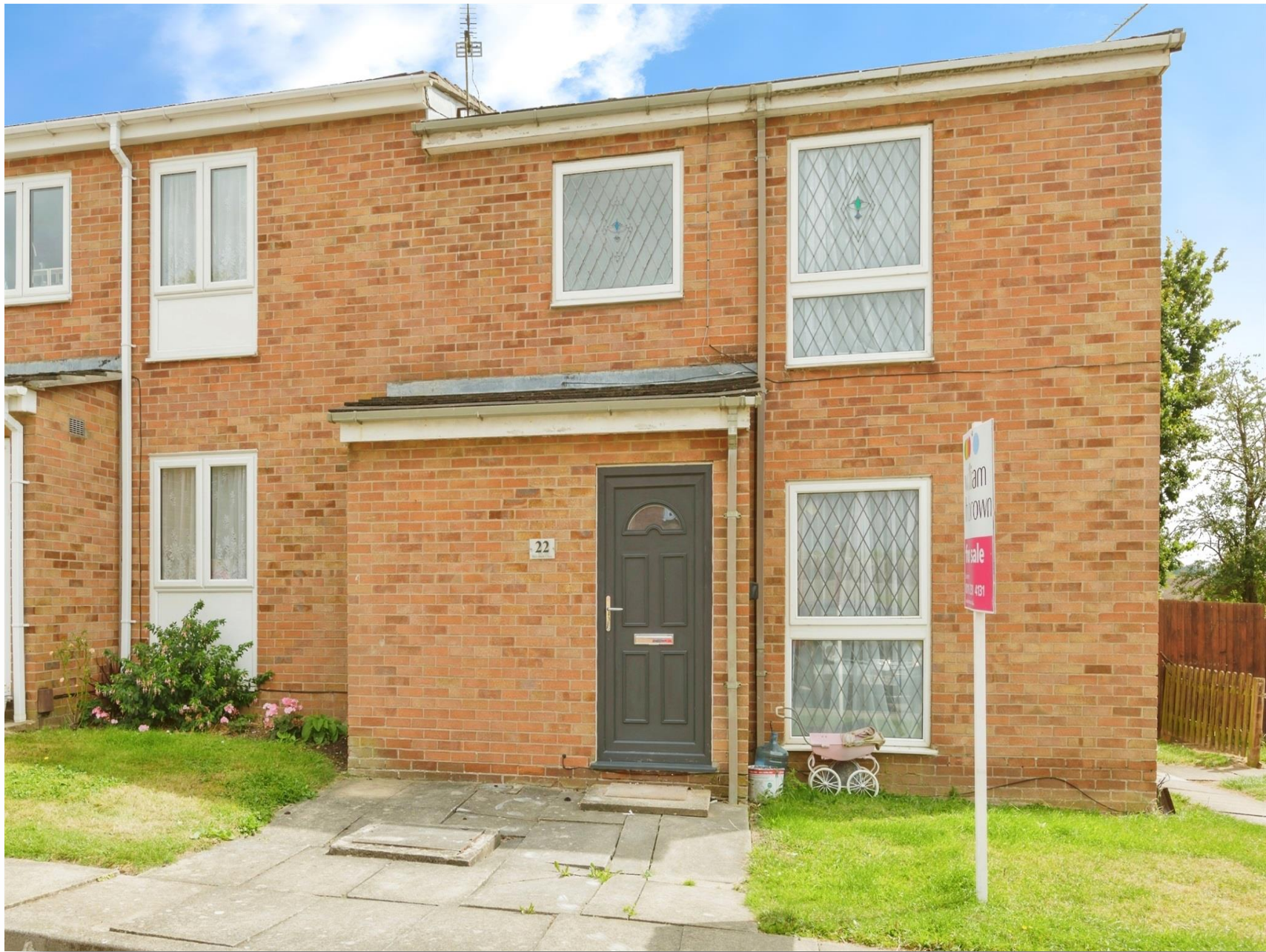
Hollybush Close, Leicester LE5 2HZ