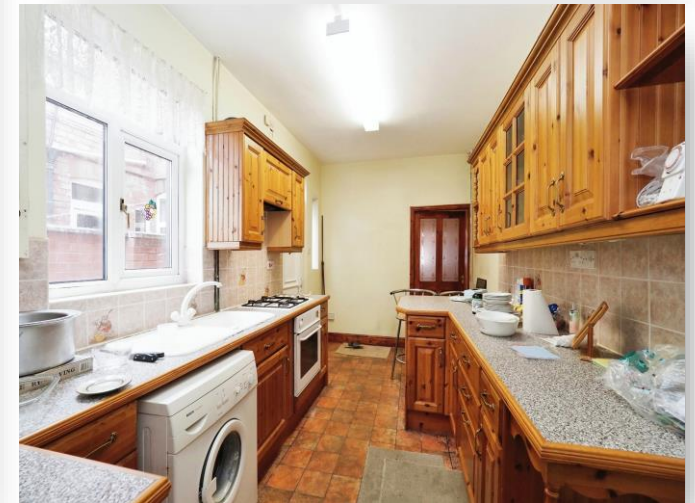
Chepstow Road, Leicester LE2 1PA