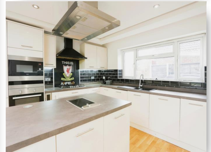
Ballater Close, Leicester LE5 6XA