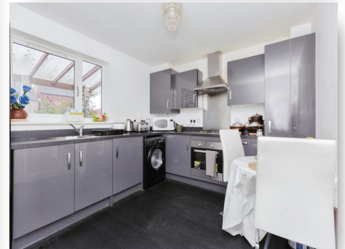
Mckay Avenue, Leicester LE4 5FD