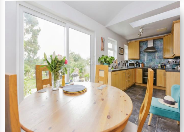
Somerville Road, Leicester LE3 2EU