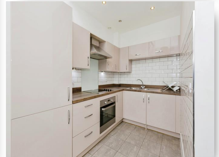
Wheatsheaf Court, Leicester LE2 6ET