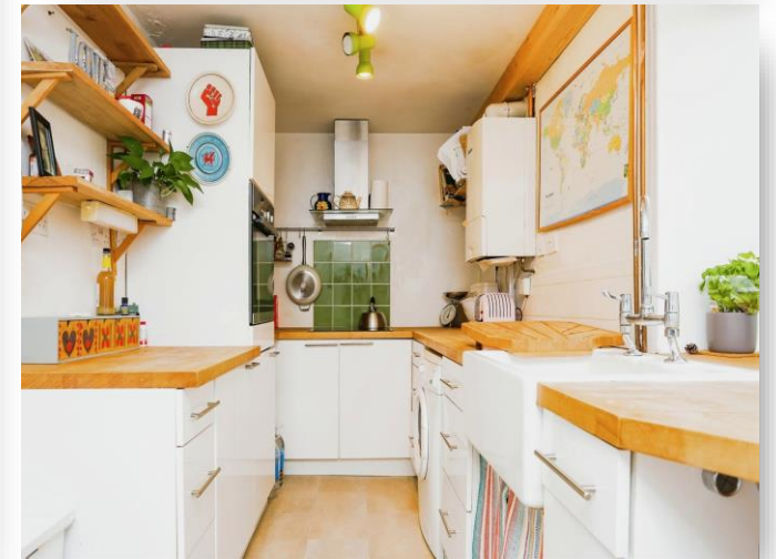
Bowhill Way, Leicester LE5 2PA