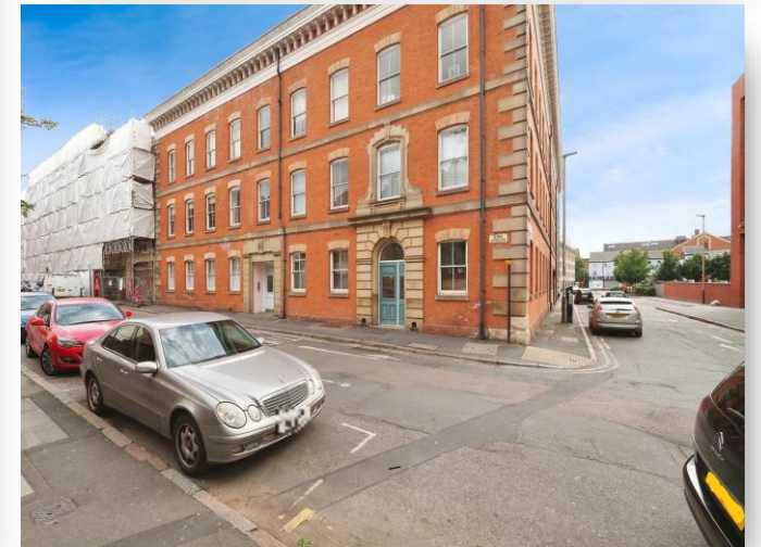
The Cotton Mill King Street, Leicester LE1 6RN