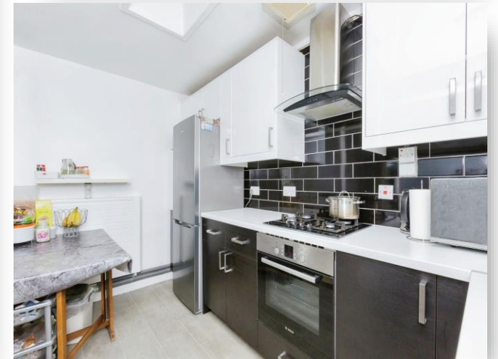
Keats Walk, Leicester LE4 6DR