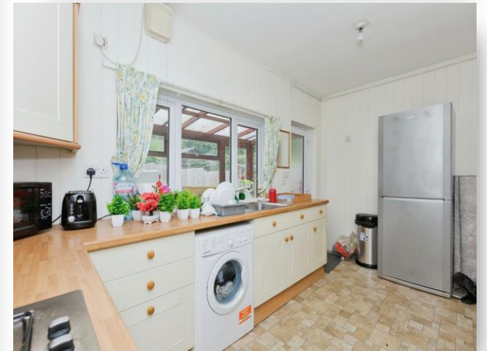
Anstey Lane, Leicester LE4 0FG