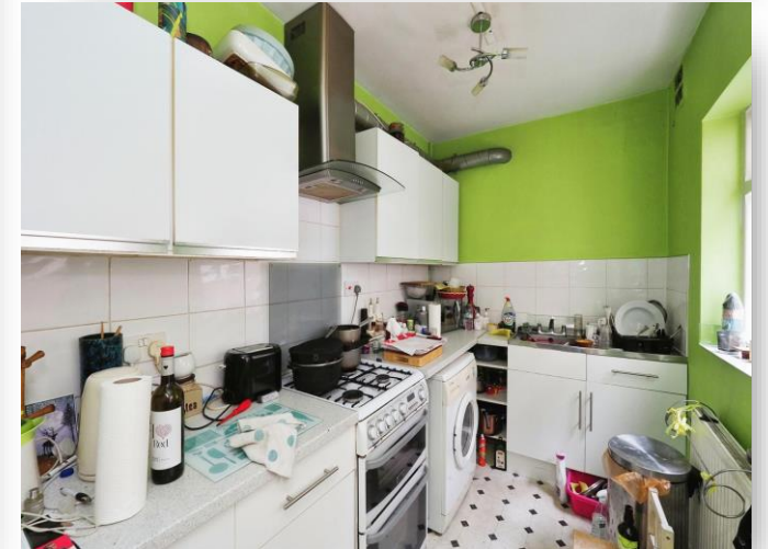
Evington Street, Leicester LE2 0SA