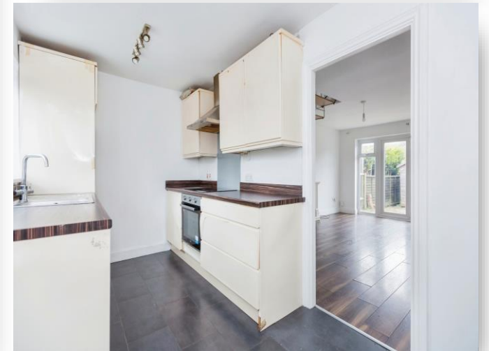
Warren Avenue, Leicester LE4 9WY