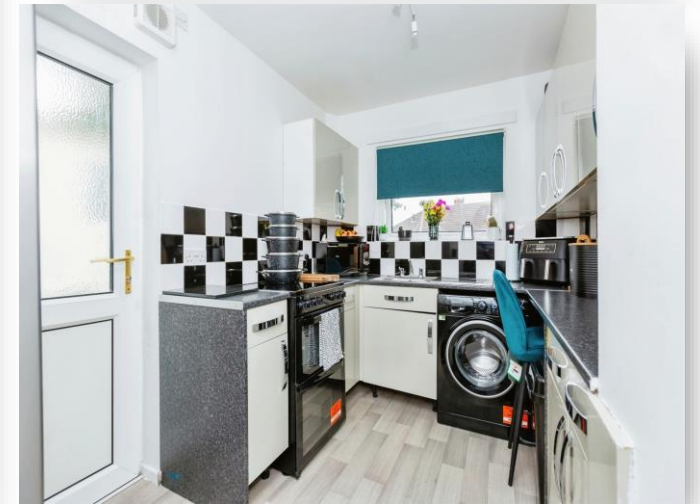
Archway Road, Leicester LE5 1RB