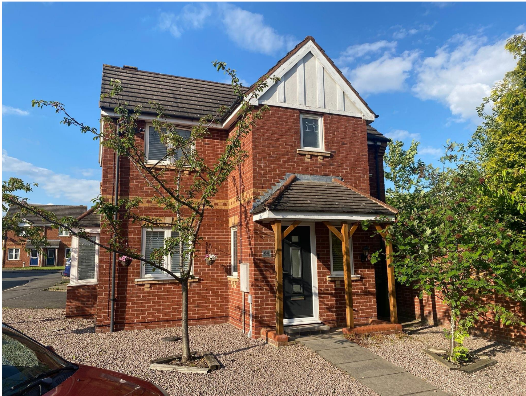
Darien Way, Braunstone Leicester LE3 3TT