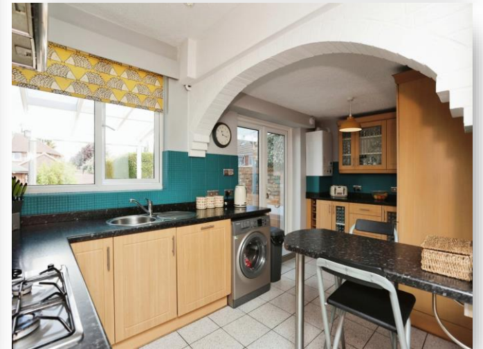
Lyndale Road, Leicester LE3 2QD