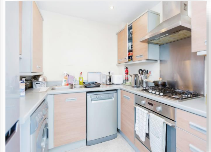
Pavilion Close, Leicester LE2 7HS