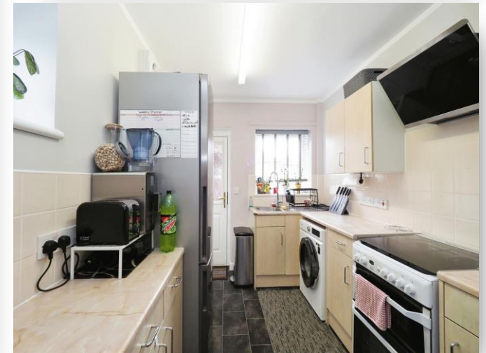
Wilmore Crescent, Leicester LE3 1SW