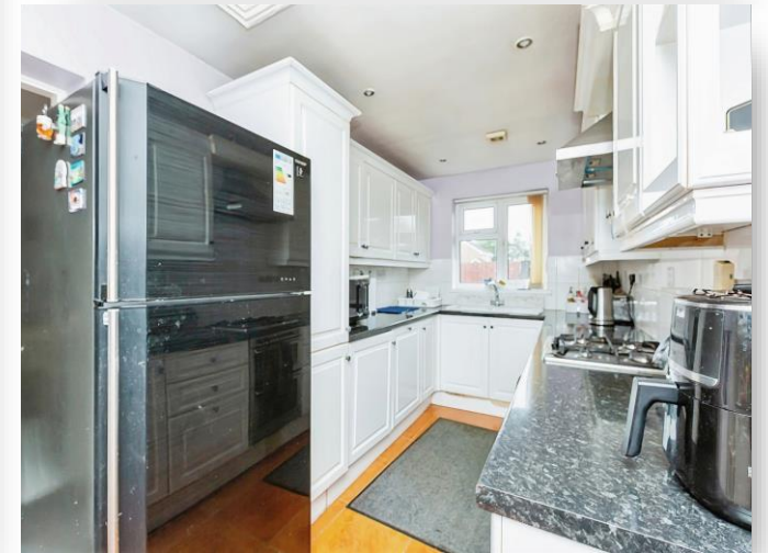
Chadderton Close, Leicester LE2 6GZ