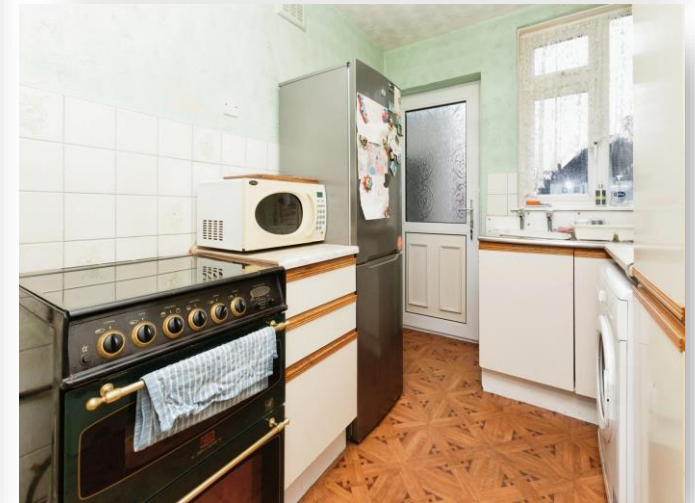
Winstanley Drive, Leicester LE3 1PB