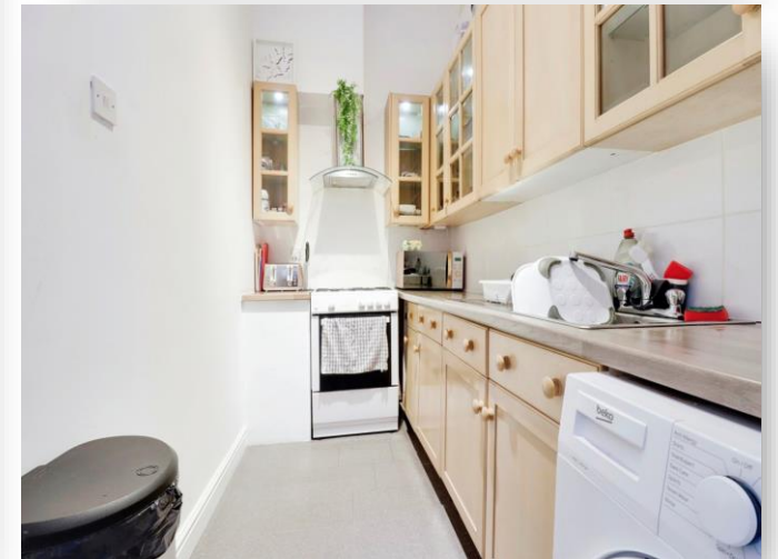
Lincoln Street, Leicester LE2 0JU