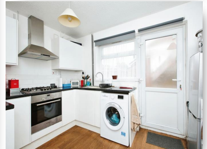
Laithwaite Close, Leicester LE4 1BW