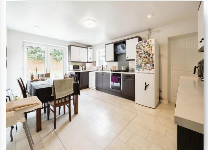
Shearer Close, Leicester LE4 7TQ