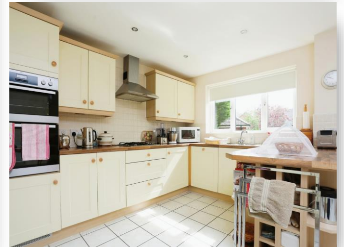
Facers Lane, Scraptoft Leicester LE7 9FS