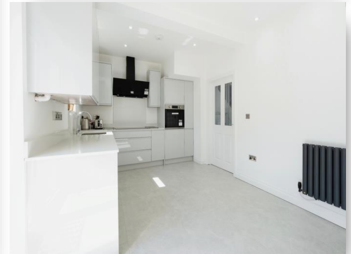
Bembridge Close, Leicester LE3 9AP