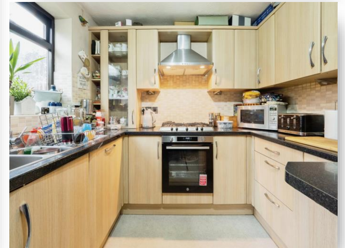
Neville Road, Leicester LE3 6DS