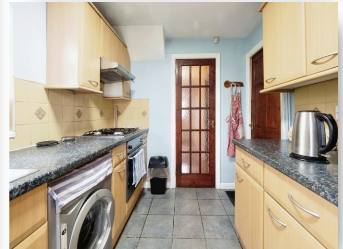
Player Close, Leicester LE4 7SZ