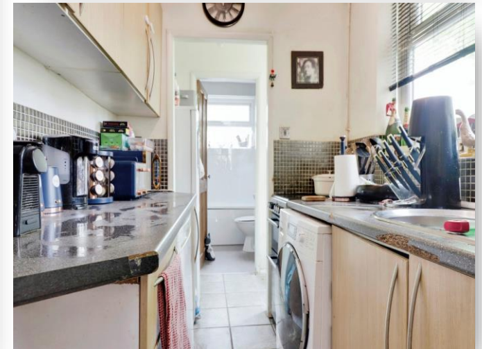
Main Street, Glenfield Leicester LE3 8DG